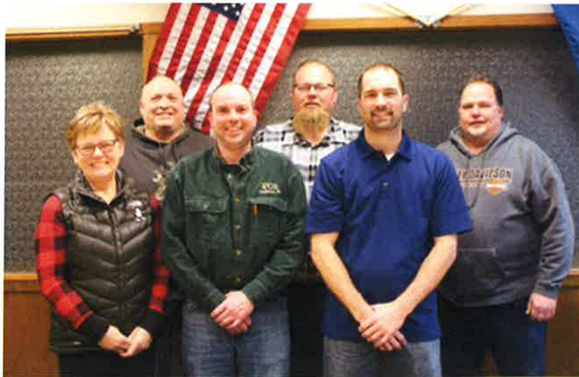
Photo: EDA 2018 members